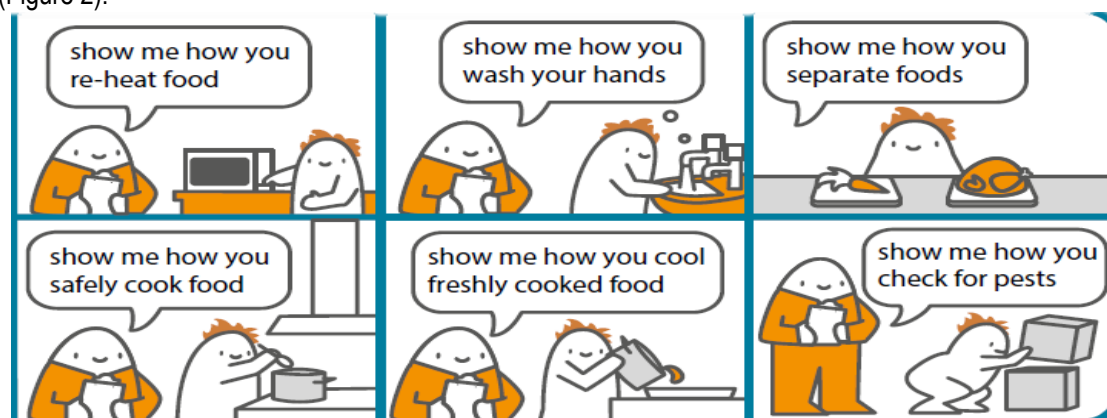
Figure 2: Staff should demonstrate they know how to follow Listeria management procedures.

Part 15 of the HC Spec requires all staff involved in processing ready-to-eat animal products to understand Listeria management appropriate to their roles and tasks. They must also be able to demonstrate these skills (Figure 2).