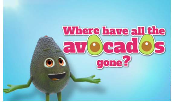
Animated video explaining early season avocado supply volumes