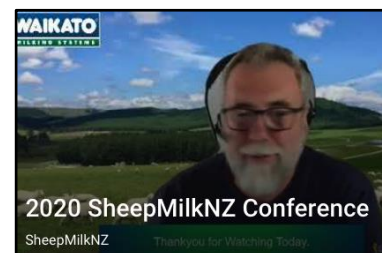
Annual SheepMilkNZ Conference, March 2020