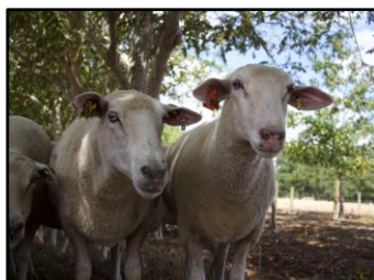
Sheep on the 'Bovine-Ovine' Outdoor Farm